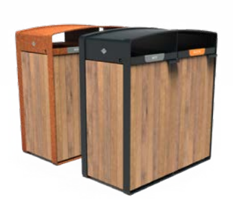
STORR 2 WASTE FLOWS 100L WOOD