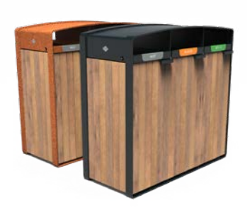
STORR 3 WASTE FLOWS 70L WOOD