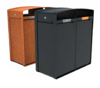
STORR 2 WASTE FLOWS 100L