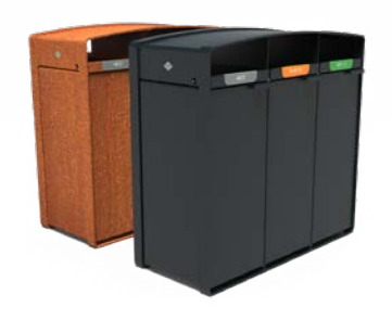
STORR 3 WASTE FLOWS 70L