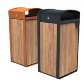
STORR 100L WOOD